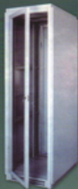
19 Inch - Rack Cabinet