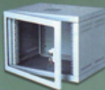
Wall Mounted Rack