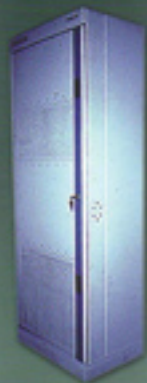
19 Inch Closed Cabinet