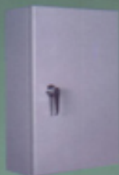
Indoor Wall Mounting IP 44