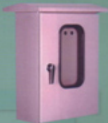
Outdoor Wall Mounting IP 44