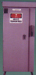
Outdoor Free Standing IP 56, ANSENEMA 4