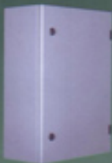
Indoor Wall Mounting IP 33