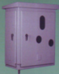
Outdoor Free Standing IP 56