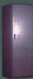
Indoor Free Standing IP 30